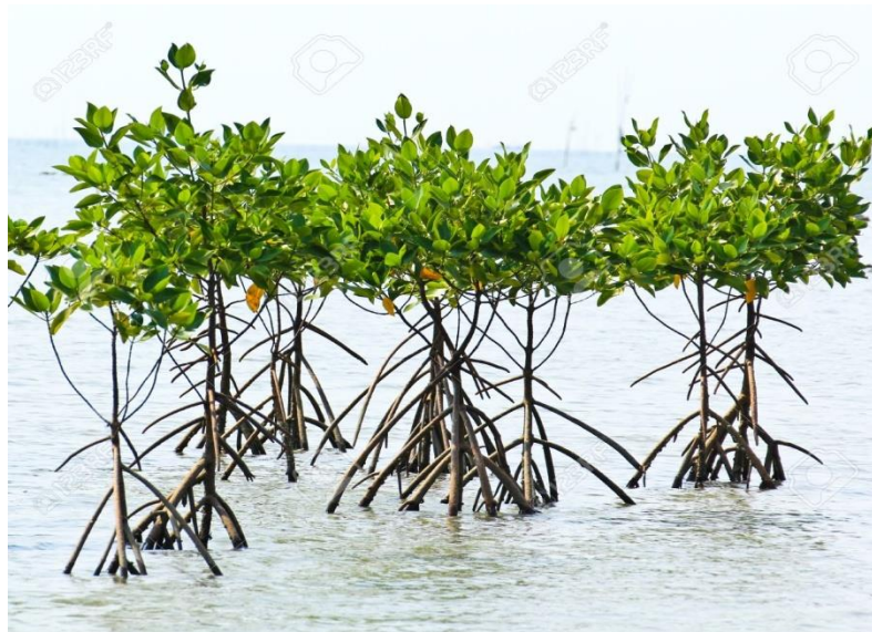
Figure.1 Schematic diagram for Rhizophoramucronata plant species.