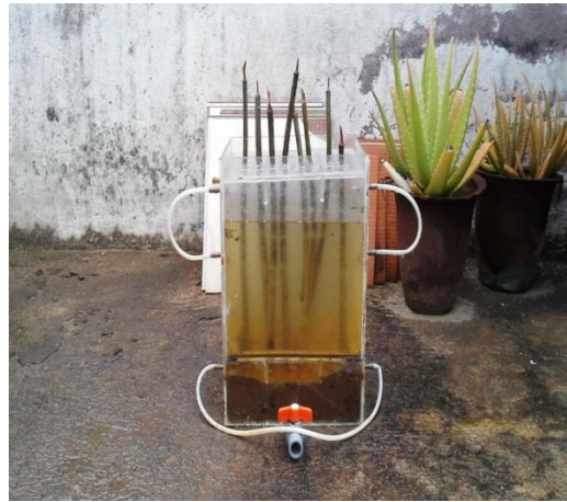
Figure.2 Schematic diagram for phytoremediation reactor

The experiments were conducted for a period of 45days, at regular intervals of 15days. After every 15days, the samples were taken from each experimental setup for the analysis of chemical oxygen demand.