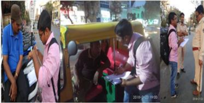
Figure 5 Questionnaire survey on C G Road

We collect 50 Questionnaire survey Samples at C G Road. From that survey we decided the rates of vehicles. The rates for four wheelers, three wheelers and two wheelers are respectively 25-30, 5-10 and 5. We also ask people for suggestion rather than the Electronic road pricing for solve the traffic problem at c g road, which is the central business district of Ahmedabad.