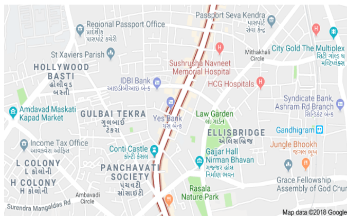
Figure 2 study area (C G Road)

Chimanlal Girdharlal Road as a study Area, colloquially the C. G. Road, is one of the major roads of Ahmedabad. It has been ranked as the costliest retail location in the city. It is named after Chimanlal Girdharlal, one of the major businessmen of the 1960s in India.