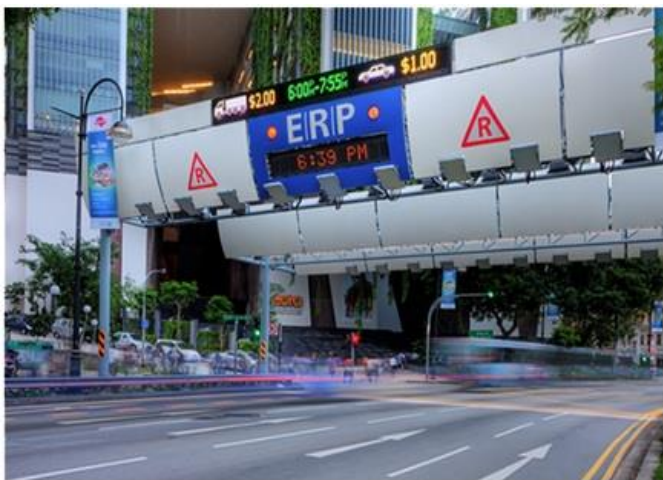
Figure 1 ERP Gantry in Singapore

With more vehicles on the road, ERP[11] remains effective in addressing current and future traffic conditions and ensuring motorists continue to have a smooth journey.