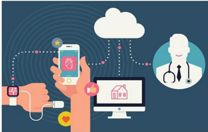
Fig -1: IOT in healthcare system