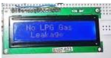
Fig -2: (Liquid crystal display; alert the user)

LCD pops up with a display, says 'Gas detected Alert ON', as shown in the figure3: