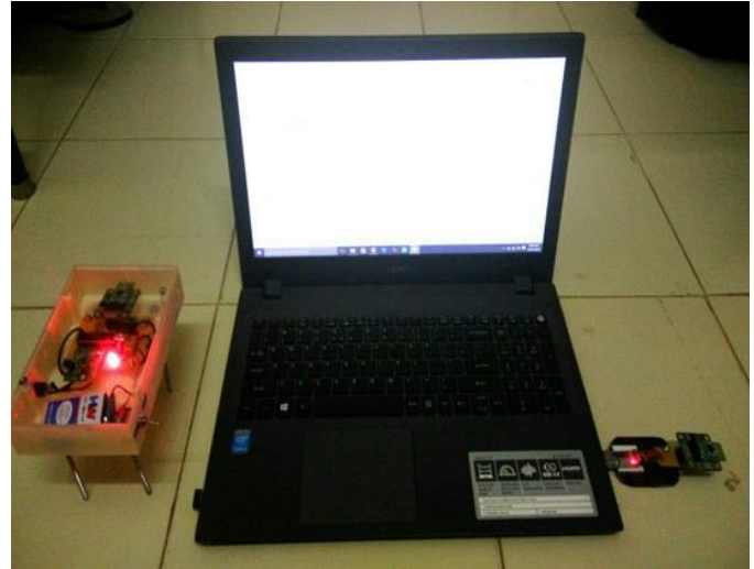
Fig.2.1. Components of the vibration measuring system

The trans-receiver will be used together with a microcontroller. It provides extensive hardware support for packet handling, data buffering, burst transmissions, clear channel assessment, link quality indication and wake on radio. It can be used in 2400-2483.5 MHz ISM/SRD band systems. 9V rechargeable batteries are used for powering accelerometer.