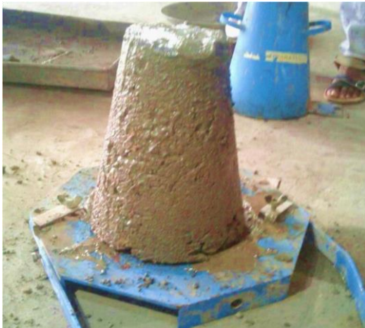
Fig -1: Slump Cone Test

To determine the reference slump value for concrete and to calibrate it against an equivalent measure using a flow table. Mould is the shape of a truncated cone with the internal dimensions 200 mm diameter at the base, 100mm diameter at the top and a height of 300 mm. Concrete is poured in three layers. Each layer is tamped about 25 times. Immediately the cone is lifted in an upward direction.