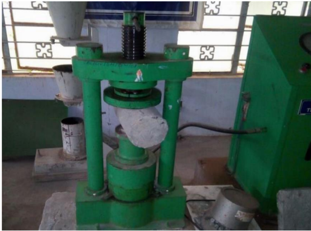
Fig -3: Split Tensile Strength Testing Machine