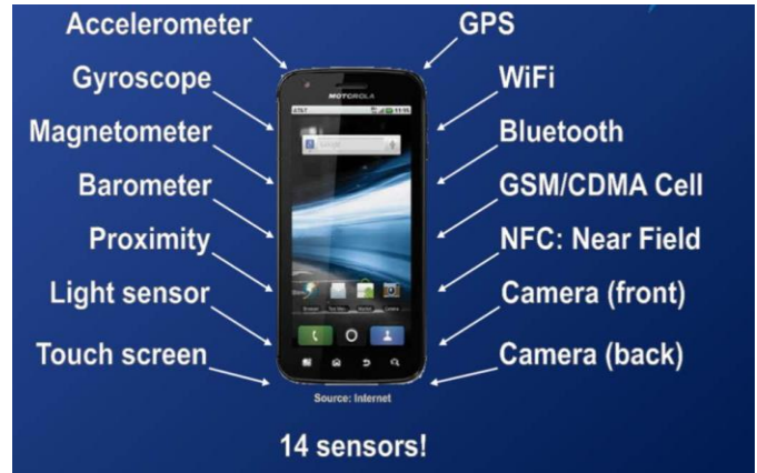
Figure 2: Various sensors in a smartphone.

and action. The concept of IOT is used and is given importance in this system as it is considered as one of the most important development and will affect the life of humans in near future. In Google, about 1500 volunteers were chosen and their daily use of smartphone was recorded for over several months. A large scale study has been presented based on neural networks which is used to interpret natural human kinematics. A comparison of several different neural architectures for efficient learning of temporal multi-modal data representations. Results from this paper convey that human kinematics convey important information about user identity. Multi-modal frameworks are more likely to provide meaningful security guarantees. A combination of face recognition and speech, and of gait and voice have been proposed in this paper [1],[2].