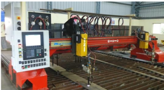
Fig-1.2 Fuel Cutting

Oxy-fuel welding and oxy-fuel cutting are the processes that uses gases as a fuel and oxygen for welding and cutting the metals, respectively. French engineers Edmond Fouche and Charles Picard became the first to develop oxygen-acetylene welding in 1903. Pure oxygen is used than that of air to increase the flame temperature that allow melting of the work piece material e.g. steel in a room environment. A common propane/air flame burns at about 1,980 °C, a propane/oxygen flame burns at about 2,253 °C and an acetylene/oxygen flame burns at about 3,500 °C. Oxy-fuel is the oldest welding processes than the forge welding. Still used in industry, in recent decades it has been less widely utilized in industrial applications as other specifically devised technologies have been adopted. Today's it is widely used for welding pipes and tubes and much more applications, as well as repair work. It is also frequently well-suited, and favoured, for fabricating some types of metal-based artwork. Also oxy-fuel has an advantage over electric arc welding process and cutting processes in various condition where accessing electricity would present difficulties; it is more self-contained, and, hence, often more portable. In the oxy-fuel welding, a welding torch is used to weld various metals. Welding metal result when two or