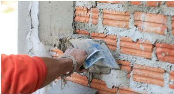
Brick mason plastering required

[3] Sawhney, A., Mund, A., Syal, M., "Energy-Efficiency Strategies for Construction of Five Star Plus Homes." The Practice Periodical on Structural Design and Construction, Vol. 7, 1, 2002. ©ASCE, ISSN 1084-0680/2002/4-174 - 181/$8.00+$0.50 per page, 4, November.