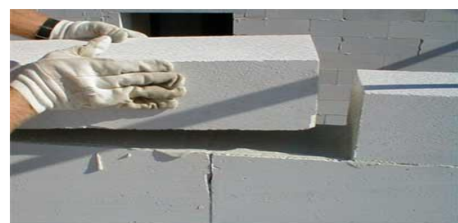
Block mason plastering not required