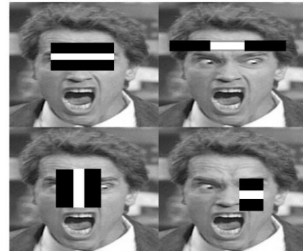
FIG 1: Sample Haar-like features for detecting face features

shown in Figure 1, is used and the difference in pixel sum for the nose and the adjacent regions surpasses the threshold, nose is identified. Haar-like features are very simple and weak classifiers, which requires multiple passes.