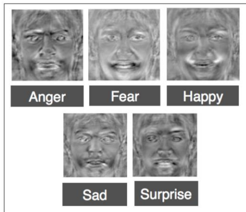
Fig. 2 Top eigenvectors reshaped to 100x100 images (Fisher faces) after Fisher LDA for Anger, Fear, Happy, Sad and Surprise.

on SW-1SB . The eigenvector corresponding to the largest eigenvalue is the known as the Fisher face for the emotion in-training, some of which are shown in Figure 2 . Fisher face for each emotion is calculated by projecting all the training data onto that particular Fisher face. binning the projection values into histograms to examine the distribution allows us to determine thresholds for each Fisher face’s projection values. The Fisher faces do reasonably in separating the classes for each emotion, as shown in Figure3.