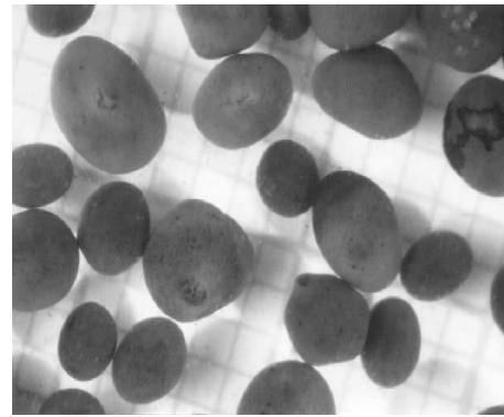
Fig -2: Anaerobic granules from the UASB reactor

The efficiency and stability of the UASB reactor depends sturdily on the initial start-up, which in turn is mostly affected by various physical, chemical and biological parameters [22], such as type of wastewaters, operational circumstances and the characteristics, accessibility and increase of active microbial populations in the seed sludge or inoculums. An acclimatization period is mandatory before the full design organic loading rates can be applied to inoculate the seed sludge. This period is usually 2-8 months [1] is quite time-consuming and has been the foremost drawback of the industrial applications of UASB reactors. The anaerobic sludge which provides anchorage to microflora is the principle element of a UASB reactor. The treatment of the UASB reactor can be achieved by the continuous interaction of wastewater with the microflora attached with the sludge particles [23]. Fig. 2 shows the anaerobic sludge granules from the UASB reactor.