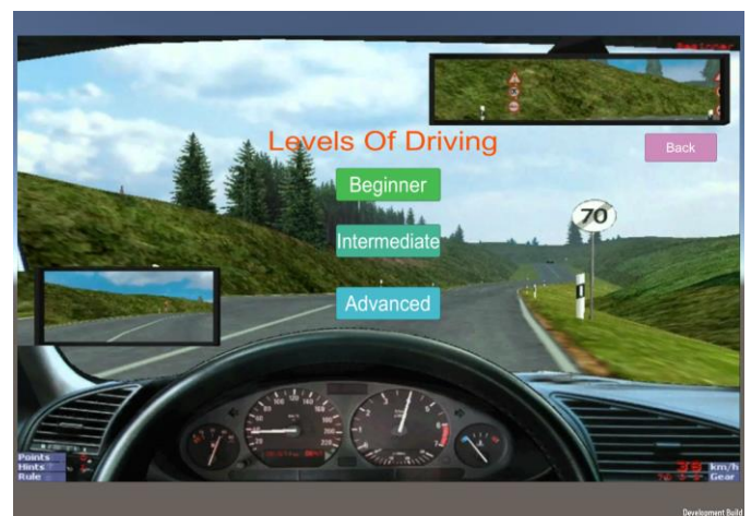
Fig 4: Level of Driving

After clicking on drive option user can drive on different driving levels is shown in following figure.