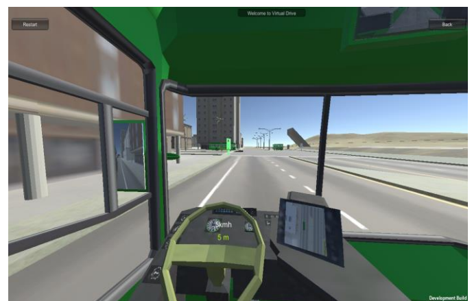
Fig 5: Beginner Level

Beginner level where simple road with traffic signal is created is shown in following figure 5.