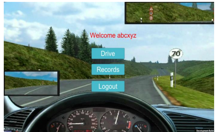
Fig 3: Login Successful

After Successful login user can drive, view previous records and can end the session shown in following figure.