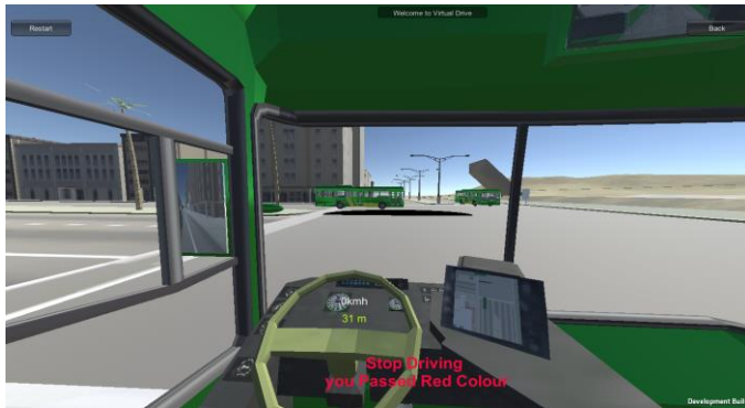
Fig 6 : Traffic Signal Violation

Alert notifications is given to rider if signal broken is shown in figure 6.