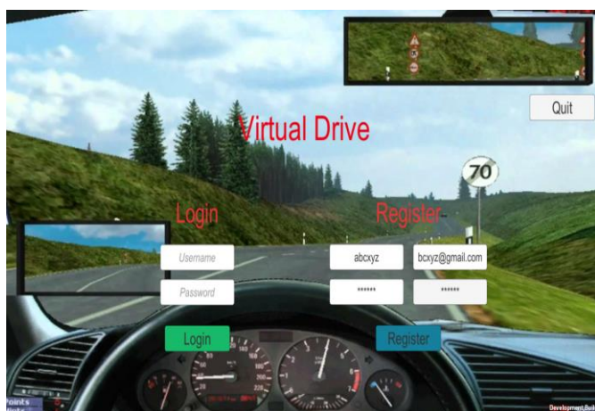
Fig 2: User Login

User registers to system using username, email-id and sets password shown in following fig 2.