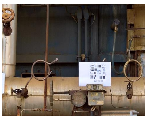
Fig. -2 : Example of digital visual inspection of a mechanic components

For example, the experience of inspections on power lines is significant and at an advanced level. The main objective of the project is to provide a low cost solution for aerial power line inspection based on unmanned vehicles which have to be able to perform long range flights in relatively short time [10]. Also interesting is the experience in refineries structures where of the drones are equipped with electromagnetic hold mount elements to stick the ultrasonic sensor probe on the surface of the metallic structure and to