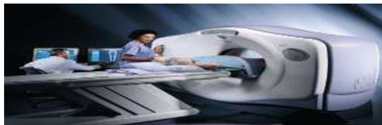
Fig- 3: CT scan [15]