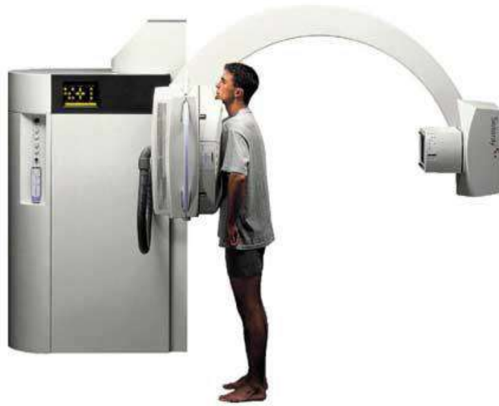
Fig- 2: Chest X-RAY [15]