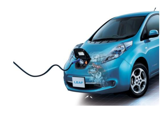
Fig -4: Nissan Leaf Electric Car

The world's top selling highway-capable electric car in history became the Nissan Leaf with over 200,000 units sold in 2015. The Tesla Model S, with global deliveries of more than 100,000 units, is the world's second best selling all-electric car of all-time. The Model S ranked as the world's best selling plug-in electric vehicle in 2015, up from second best in 2014.