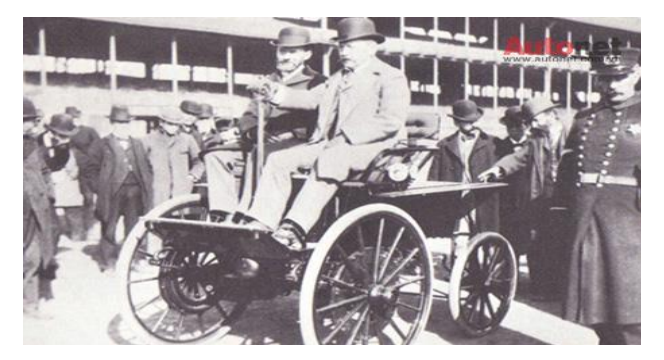
Fig -3: Morris and Salom's Electroboat used as cab in New

In 1894, the first commercial electric vehicle was Morris and Salom's Electroboat show. This vehicle was operated as a taxi in New York City by its inventors company. The Electroboat proved to be more profitable than horse cabs despite a higher purchase price (around 3000 vs. 1200$ in that era). It could be used for three shifts of 4h with 90-min recharging periods in between. It was powered by two 1.5 hp motors that allowed a maximum speed of 32 km/h and a 40-km range.