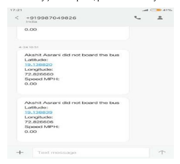
Fig-4: Text message sent to Parents

The automatic updates were sent by text messages to school authorities and the parents with the live location of the bus at every junction point, pre-fed into the system.