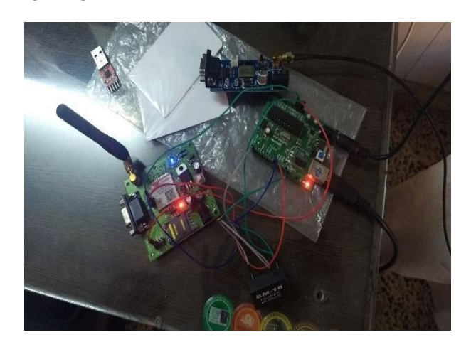
Fig-2: Hardware Components

The parents receive the live GPS coordinates of the bus when their ward boards the bus. The server is accessible to the school authorities. All the information about the bus and the status of students present and absent is updated automatically. The entry of a student onto the bus will be displayed on the LCD. The entire system is driven by a Microcontroller. The RFID reader starts scanning when the bus reaches the first bus stop. The LCD then displays a timer for 10 seconds within which the boarding student should scan his card. This same process is repeated for the next bus stops. Based on the received information from the RFID tag the parent is notified via text message on their phone whether the child boards or leaves the bus. The GPS module installed in the bus keeps a track of its location all the time and simultaneously updates the server thus integrating with the NodeMCU.