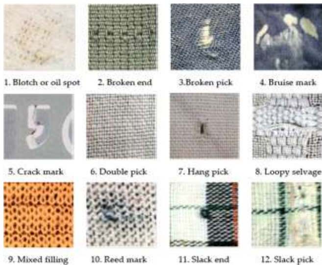
Fig -1: Various fabric defects