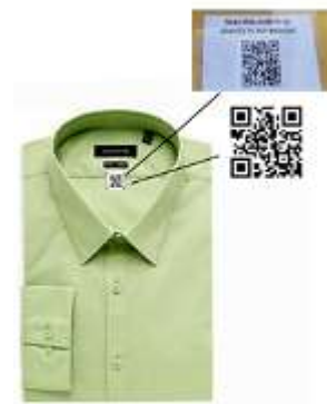
Fig -1: Basic Positioning of QR code in a cloth.

A laminated QR-code is impervious to water and dust, pressure is implanted inside the clothes. The QR-code has a special ID written in it by manufacturer. The manufacturer will create a new entry for the Id, fill his side of the table information. The retailer, after selling the product will fill a couple of extra points of interest. In the user side, the QR-code will be scanned by the Mobile Application, then the Id will be read by it. It is cross referenced with the database after that, corresponding details are retrieved.