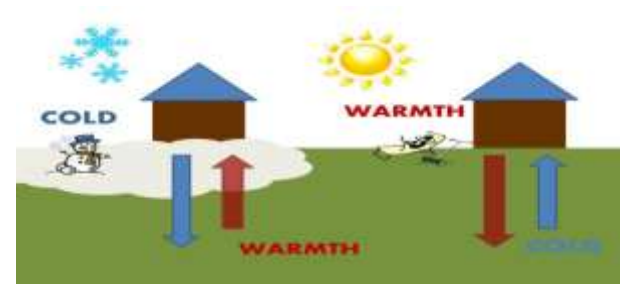
Fig 3: Geothermal Heating and Cooling

Geothermal Heating and Cooling systems provide space conditioning heating, cooling and humidity control. Geothermal heating and cooling systems work by moving heat, rather than by converting chemical energy to heat.Every geothermal heating and cooling systems has three major subsystems or parts: a geothermal heat pump to move heat between the building and the fluid in the earth connection, an earth connection for transferring heat between its fluid and the earth, and a distribution subsystem for delivering heating or cooling to the building.