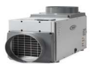
Fig 4: Ventilator with Dehumidifier

This ventilator removes excessive moisture from ventilated air in buildings located in areas with mild temperatures and high humidity in winter. Without this ventilator the air conditioner has to do all the work of conditioning the humid outdoor air, which can lead to over cooling and wasteful energy management. The ventilator removes humidity from the ventilated air before it reaches the building's living space.