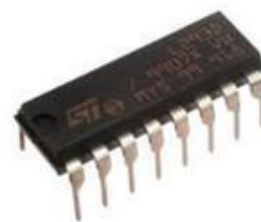
Fig-3 : Motor Driver

Driver IC which allows DC motor to drive on either direction. L293D is a 16-pin IC which can control a set of two DC motors simultaneously in any direction. It means that you can control two DC motor with a single L293D IC, Dual H-bridge Motor Driver integrated circuit (IC). The L293D can drive small and quiet big motors as well.