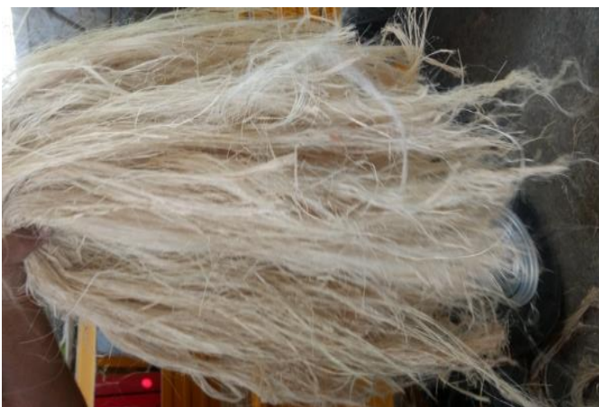
Fig -1: Raw Banana Fibers

Banana fiber used in this researched work was procured from Amit Fibers Pune, India. These banana fibers were obtained by mechanical extraction from banana stem by using fiber extraction machine. These fibers were further separated with hand. Figures 1 and 2 shows the banana fibers. The diameter of the fiber used in this work was measured by using tools makers microscope. The average diameter of the fibers was 300µm.