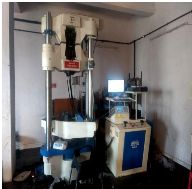
Fig -3: Universal Testing Machine

Specimens used for tensile test were prepared as per ASTM D3039. The experiment was performed on the universal testing machine TUF-C-1000 manufactured by Servo with the crosshead 2 mm/min speed and at standard temperature and pressure (shown in figure 3). Three specimens were tested for test configuration. The tensile test set-up is shown in figure 4.