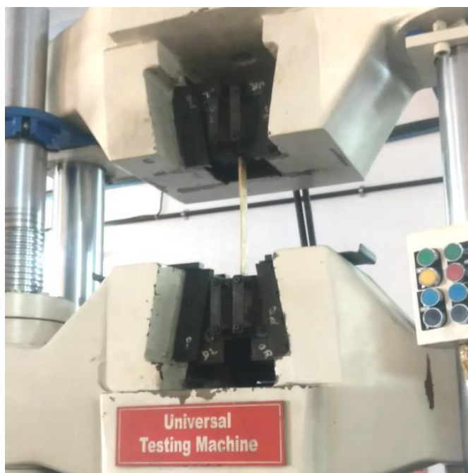
Fig -4: Tensile Test Set-up

After the specimens were tested on UTM, the readings shown in table no 2 were obtained.