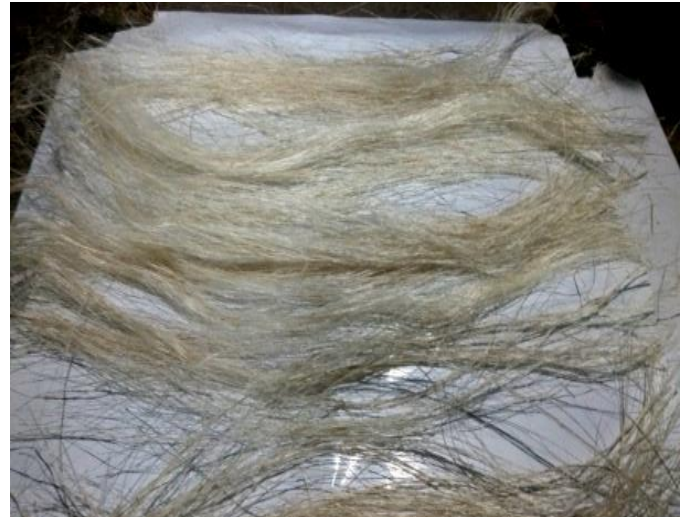
Fig -2: Separated Banana Fibers