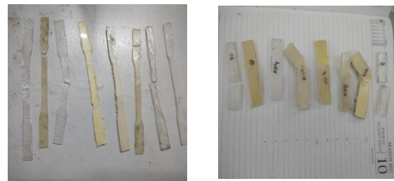
Fig 1.6 Tested Laminates

In here ANG 200 and 400 GSM HFRC laminates gives a worthy results and also, even if it had a failure at the time of load carrying the strength is quickly reduced but after at some point level it has gain as shown in the figure