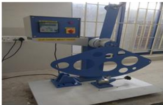
Fig 1.4 Impact test

The outcomes were depicted aramid fiber is great in quality however not great in prolongation. For this situation Nylon strands gives a decent outcome in stretching yet not all that well in quality.