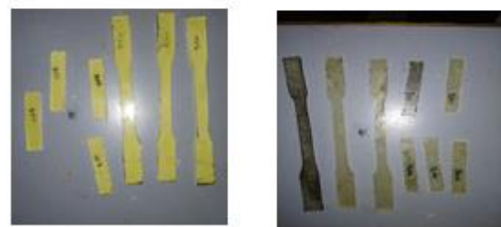
Fig 1.2 ASTM standard laminates