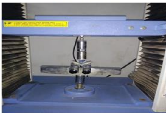
Fig 1.5 Flexural test

By the blend of aramid and nylon HFRP composite not give a normal outcome as a result of holding issues. So by getting ready glass filaments like 200 and 400 GSM overlays with aramid and nylon textures give a superior come about by looking at different composites. The main concept of Strain hardening is the process of making the material to harden after deformation and to increasing stress on a material.