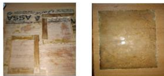
Fig 1.1 Polymer composite

It manages the manufacture stages used to acquire the composite material. The means associated with Hand-Lay-Up strategy for advancement of fiber fortified composite is same for the manufactured filaments. There are eight states of FRP overlays are utilized here in like manner aramid, nylon and glass with various grams per square meter for FRC and HFRC covers. By setting up a form in 150mm X 200mm X 15mm putting with overhead projector sheet and remover for simple to evacuate and dealing with the overlay shows in fig 1.1. Planning of epoxy framework by 1:10 proportion connected at base layer of form. For FRC overlays applying single fiber tangle with shape measurement and furthermore for HFRC covers utilizing diverse fiber mats with form measurement used to submerged by epoxy gum. Again applying epoxy network up to the level secured with overhead projector sheet and curing at room temperature for two days. The testing of FRC and HFRC laminates are done with the help of ASTM standards, before testing the laminates shown in figure 1.2