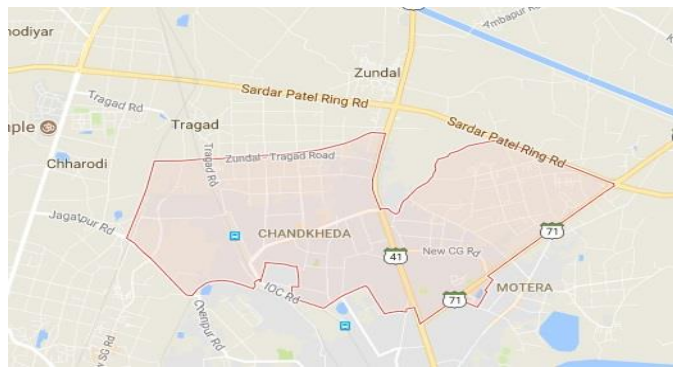
Figure 2: Location map of Chandkheda

In addition the study of this research is limited to selecting only two neighborhood area. These two neighborhoods are compared and verified with the indicators of the sustainable transportation system. These two neighborhoods are Chandkheda and Kathwada, which are located at the edge of the city of Ahmedabad.