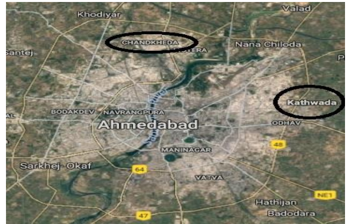
Figure 4: location map of neighbourhood

The population of Kathwada is 23,300 and contains the area of 7.25 sq. km. The density of Kathwada area is 3,217/km sq. It contains the household of 4,940.