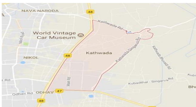
Fig 3: Location map of Kathwada

Also one is located near the city center and the other is located far from the city center.