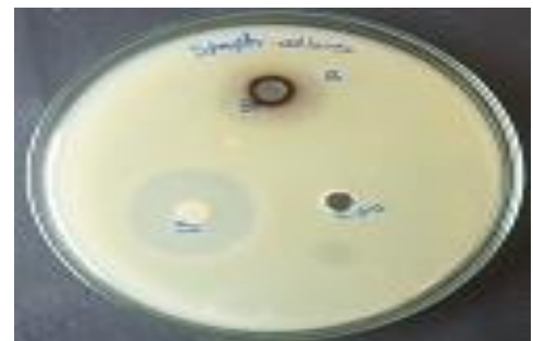
Fig-3: Zone of inhibition of prepared nanoparticles for S.aureus.

Fig.3 shows the antibacterial activity of prepared silver nanoparticles against Staphylococcus aureus. The prepared silver nanoparticles display best activity in Staphylococcus aureus (14 mm). The disparity in the sensitivity or resistance to both pathogens could be due to the variations in the cell structure, physiology, metabolism,