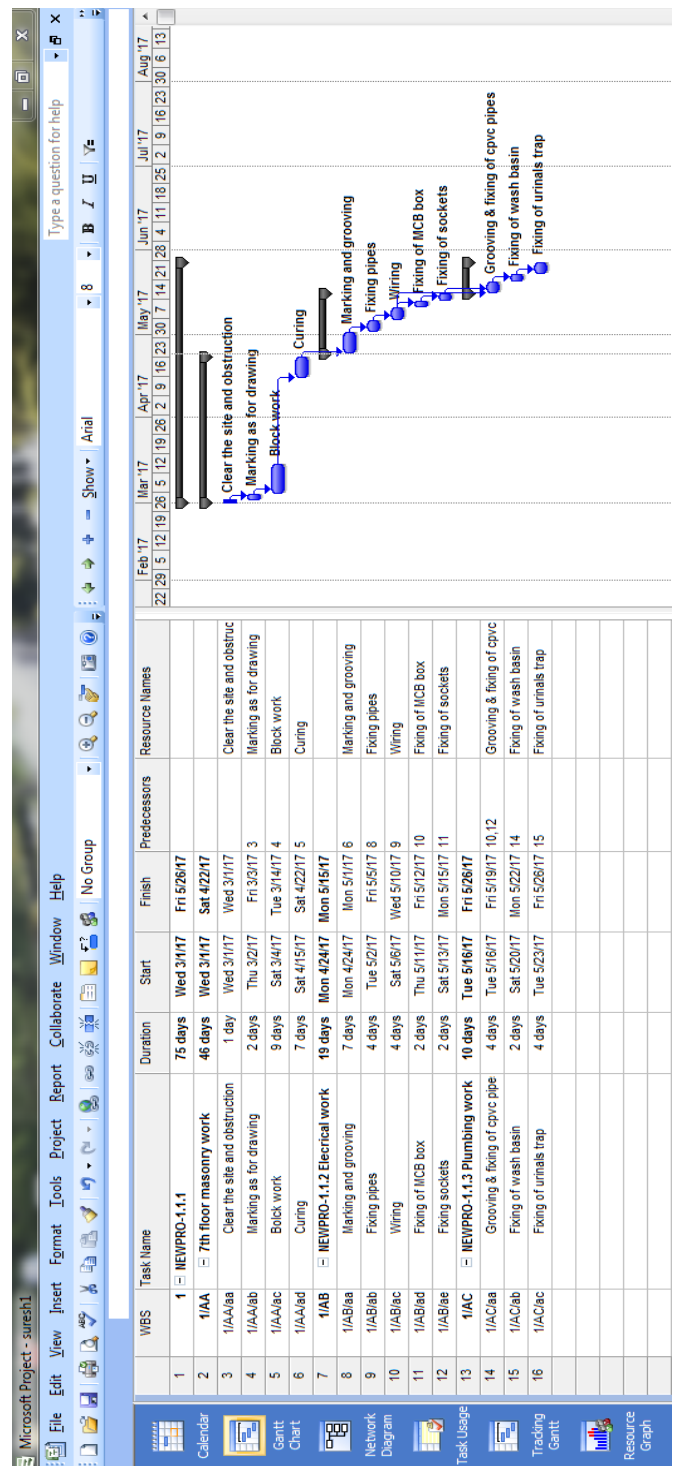
Fig -2: Activities of "FOUNDATION SILVER SPRING" residential building Project

green grass marking as per design drawing footing CC bed and pit shallow surface dressing or water bar removing. PCC reinforcement work bar bending shuttering and centering RMC concrete work and finally de-shuttering formwork have completed as shows the Fig -2 and 3