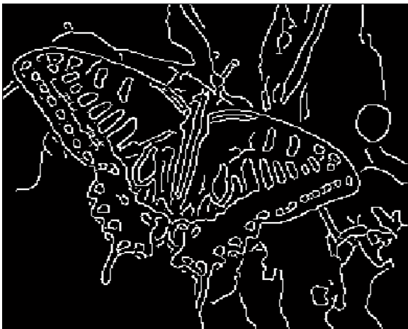
Fig. 4 Represent Edge feature of an image.

Edge Feature: As picture is a gathering of power esteems, and with the sudden change in the estimations of a picture one imperative element emerges as the Edge as appeared in figure 4. This element is use for various sort of picture protest discovery, for example, expanding on a scene, streets, and so forth [15]. There are numerous calculation has been created to adequately call attention to every one of the pictures of the picture or edges which are Sobel, perwitt, shrewd, and so forth out of these calculations vigilant edge recognition is outstanding amongst other calculation to locate every conceivable limit of a pictures.