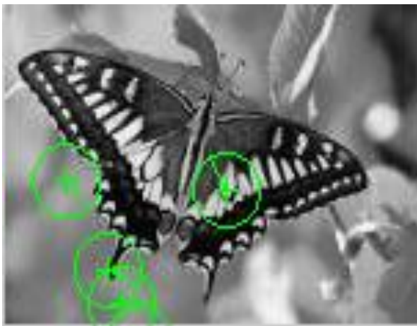
Fig 5 Represent the corner feature of an image with green point.

Corner Feature: In order to stabilize the video frames in case of moving camera it require the difference between the two frames which are point out by the corner feature in the image or frame [14]. So by finding the corner position of the two frames one can detect resize the window in original view. This feature is also use to find the angles as well as the distance between the object of the two different frames. As they represent point in the image so it is use to track the target object.