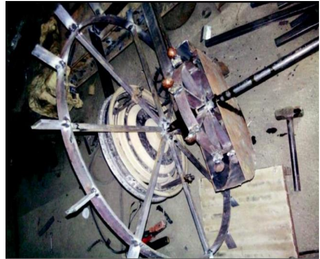
Fig 3. Actual wheel

Seed metering device meters the quantity of the seed which is going into the farm. It also maintains the required level of the sand in the tank. Mostly metering is necessary to track the amount of seed also determine the when the seed tank is again filled. It gives the length or the distance which can be sowed. Thus only required seed falls for every rotation of the wheel.