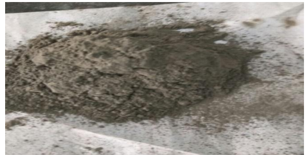
Fig: 3 Fly-ash

The fly ash used for the study was of F-class. Class F fly ash is designated in ASTM C618 and originates from anthracite and bituminous coals. The chemical composition of fly ash is given below.