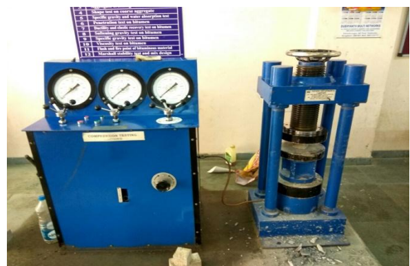
Fig.8 Compressive Strength Testing Machine