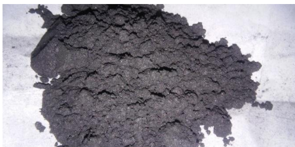
Fig: 2 Reduced Graphene Oxide

Reduced Graphene Oxide is a material which has high surface to volume ratio. The reduced graphene oxide was purchased from United Nano Tech limited. The features of RGO are as given in the table.