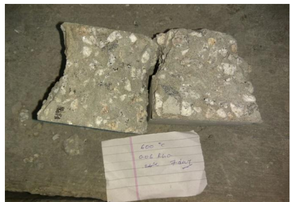
Fig.9 Specimen after failure

The compressive strength of all concrete specimens was determined following Indian Standards procedure. The specimens were removed after 24 hours from the moulds and then immersed in water until their respective testing period. For each test three specimens were tested for the determined the average compressive strength. Test was performed on compressive testing machine having capacity of 1000 MT. the average values of samples has been reported below.