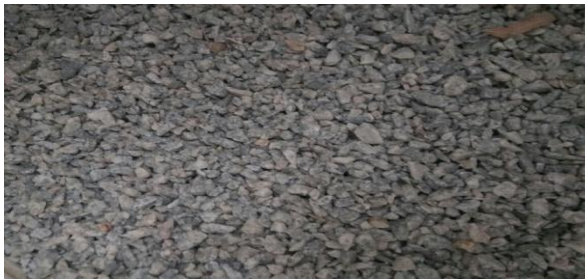
Fig.5. Course Aggregate

These are the crushed stones size ranging from 4.5mm to 20mm the aggregates used were as per IS: 383.