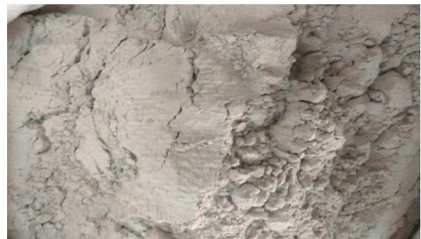
Fig: 1 Ordinary Portland cement

In this experiment we have used Ordinary Portland Cement of grade 43 (Ultra tech Cement) with IS: 8112-1989. The cement was in light grey colour with good chemical and physical characteristics.