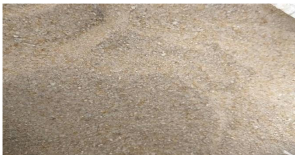
Fig. 6. Fine Aggregate

These aggregates vary from size 150micron to 4.5mm as per IS: 383. This was brought from Cauvery River and screening was done to remove oversize aggregates.