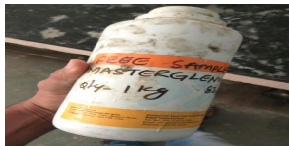
Fig.4 Masterglenium Sky 8341

The chemical used as a super plasticizer was masterglenium sky 8341. This was provided free from BASF Bengaluru. This was used 0.5% as to increase the workability of the concrete.