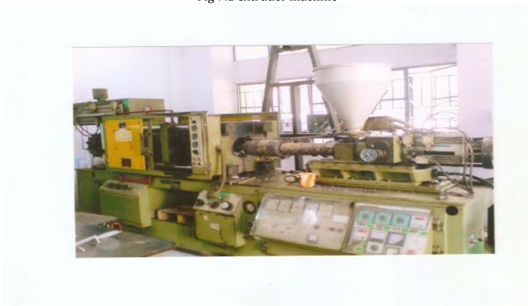
Fig 7.2 injection moulding

The outcome of material is tested for various properties such as tensile, flexural, impact and hardness in the strength of materials laboratory. The outcome material dimension is 15*20*3mm. The output specimen is immersed on the ground water for 24 hours.