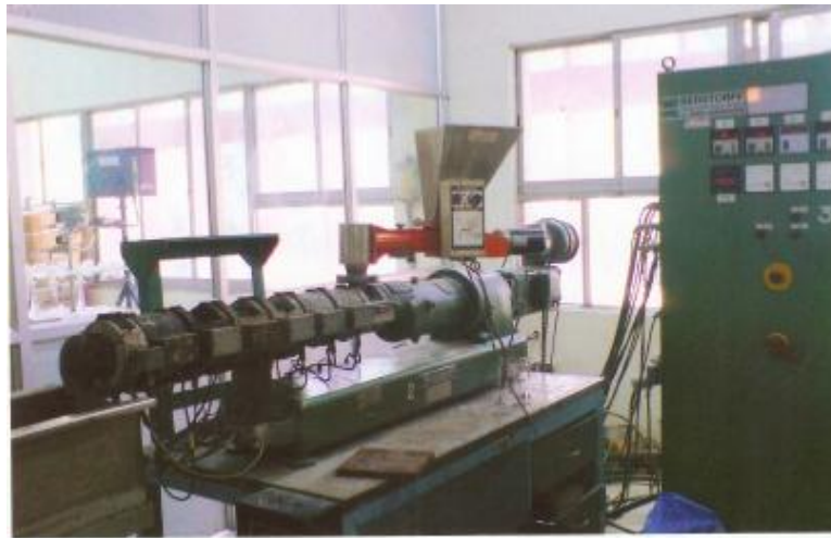
Fig 7.1 extruder machine