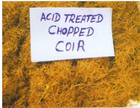
Fig 4.1 acid treated coir fiber