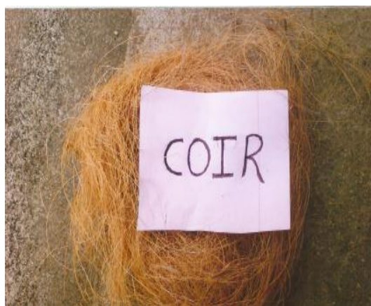
Fig 2.1 coir fiber