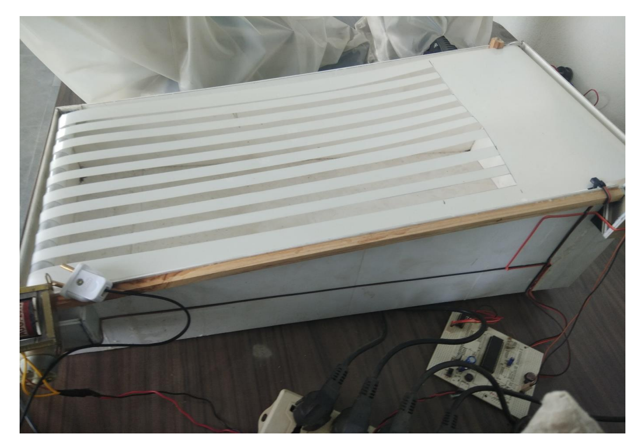
Figure of Project Prototype

reprogrammed in-system or by a conventional non-volatile memory programmer. By combining a versatile 8-bit CPU with Flash on a monolithic chip, the Atmel AT89S52 is a powerful microcomputer, which provides a highly flexible and cost-effective solution to many embedded control applications. By using this controller the data inputs from the smart card is passed to the parallel port of the pc and accordingly the software responds. The IDE for writing the embedded program used is KEI L software.