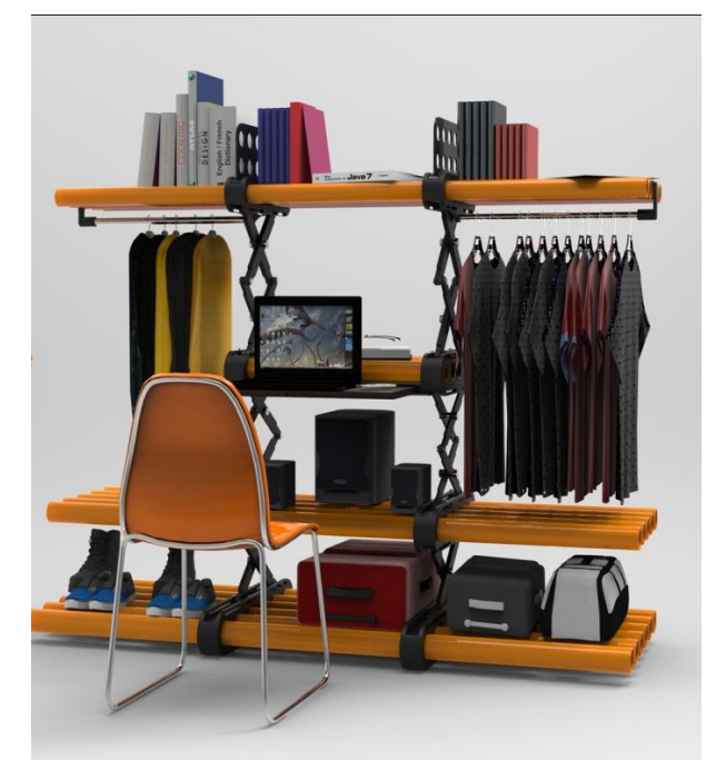
Fig-5: Rendered image of the final product in use