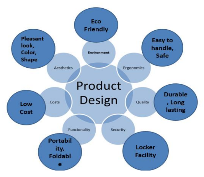
Fig- 1: Revised customer needs assessment

Based on the questionnaire and the surveys done, the product design got more optimised. The optimised methodology will make the processes more focussed to the final stage of the product and its effectiveness. The revised needs and target specification is as shown below.