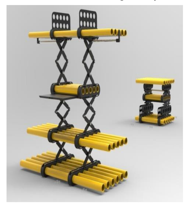
Fig-4: Rendered image of the final product

The rendering is done in the KEYSHOT 4. This is done to understand the final product and its aesthetic looks. Below shown are the rendered images of the product