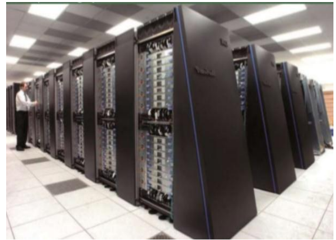
Fig 2.Blue Gene Supercomputer

The major machine used by Blue Brain Project is a Blue Gene Supercomputer built by IBM . This is it got its name as Blue Brain. Its specifications are it has 4096 quad-core nodes. Each core is a power is a PowerPC 450,850 MHZ .It has 56 teraflops, 16 terabytes of memory and 4 racks ,one row, wired as a16*16*16 3D torus. It also has1PBof disk space, GPFS parallel file system. Its operating system is Linux SuSE SLES 10.This machine is the 99 th fastest supercomputer In the world in November 2009.Silicon Graphics- A 32-proceesor silicon Graphics Inc.(SGI) system with 300GB of shared memory is used for visualization of results. Clusters of commodity PCs have been used for visualization tasks with the RT Neuron software. Due to the usage of large memory system in blue gene supercomputer, the computer becomes over heated in order to cool the system during the data storage the IBM invented a new method in 2015.A special room was built for the blue gene super computer at the EPFL and the machine site on the top of a large room that holds the cooling equipment and the computer cabels. Ice cold water from lakes. Geneva is pumped into support the cooling system.