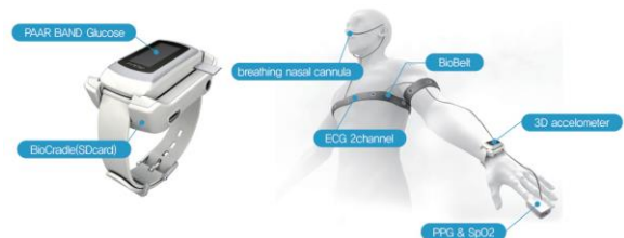
FIG.3 Home care kit and wearing example.

Author Seol young Jeong represented a homecare kit platform that can support the medical care service. In the proposed platform, the homecare kit consists of wearable devices with embedded biosensors: Accelerometer(ACC), photoplethysmograph (PPG)/ blood oxygen saturation level (SpO2), Breathing, electrocardiogram (ECG); the user can easily wear and use the homecare kit for measuring the bio-signal in daily life or while sleeping [14]. The ACC data recognize the user’s movement under sleep or when running or walking. Hence, during these activities, Seol young jeong