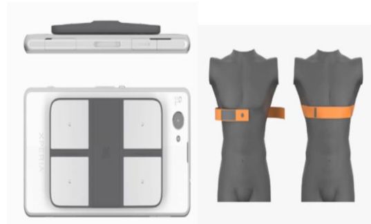
Fig-1 Device for physiological signal acquisition.

The author Rubin Dias stressed over Wireless Body Sensor Nodes (WBSNs) [5-6]. The WBSNs was an embedded sensor platforms for bio-signal acquisition. Author offer a compelling solution for long-term monitoring of subject, presenting little discomfort for the subjects and requiring minimal supervision from medical staff. Proposed WBSNs was able to acquire and wirelessly transmit different bio-signals (e.g. blood pressure, pulse and electrocardiograms [7]. In addition to acquisition and wireless transmission of bio-signals, state-of-the-art WBSNs embedded advanced processing applications, able to automatically retrieve diagnostic information from the acquired data.[8] The presented work as shown in Figure.1