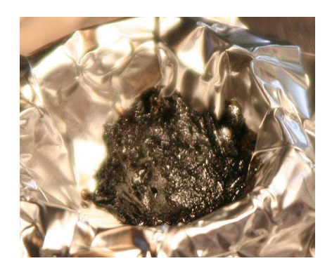
Fig-7: Tar (Residue) like substance

Finally some residue is obtained because of using all types of plastics. The residue is like a tar which can be used in road process. So there is no wastage arises here at the end of the process.