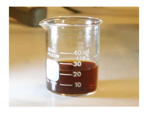
Fig-5: Sample Beaker (Condensate collector)

After condensation process the obtained liquid fuel is collected in beaker used as a condensate collector. This collector size or volume depended upon volume of production. Here only little amount of plastic is used so the fuel obtained is also lesser.