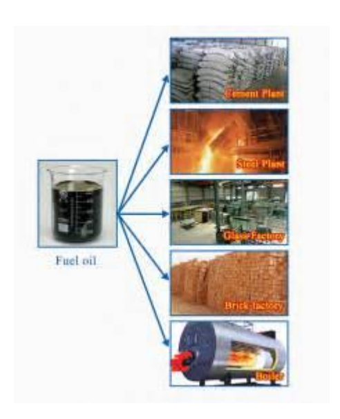
Fig-6: Fuel and its usage