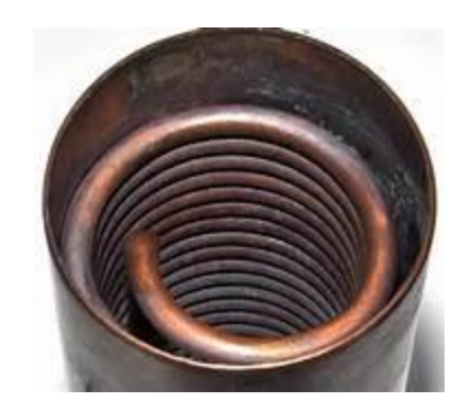
Fig-3: Copper tube coiled condenser

Condenser is used for converting the plastic vapours in to the Polyfuel. Coiled condenser is used for this experiment in which copper coil is inserted in to the water bath of carbon