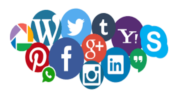
Figure 1: Social Media[2]