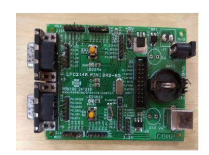
Figure 7: ARM7 Microcontroller Board

It is a microcontroller board manufactured by Philips which is used to for controlling purpose of the unique fingerprint module, when to receive the information and provides commands to LCD for displaying the data.