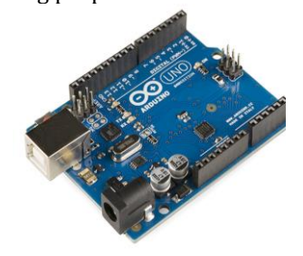
Figure 3: Arduino Uno Board

The Arduino Uno is a microcontroller board dependent upon ATmega328p manfactured by ATMEL. It is a central unit which monitors the alcohol sensor and metal detector. It is used for controlling purpose.