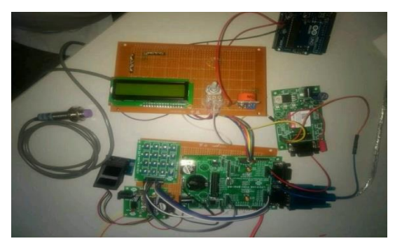
Figure 12: Model of proposed system

If the range of alcohol is greater than 800, the buzzer and Red LED turns ON and it indicates that the person is drunk. Similarly, if the percentage of metal is more than 25 it indicates the person has some metal and again the buzzer and Red LED turns ON.