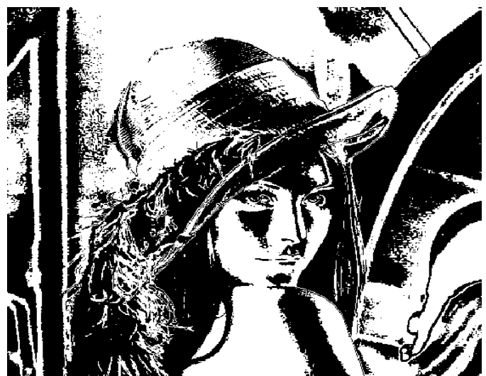
Figure 3.2- Processed Lena image