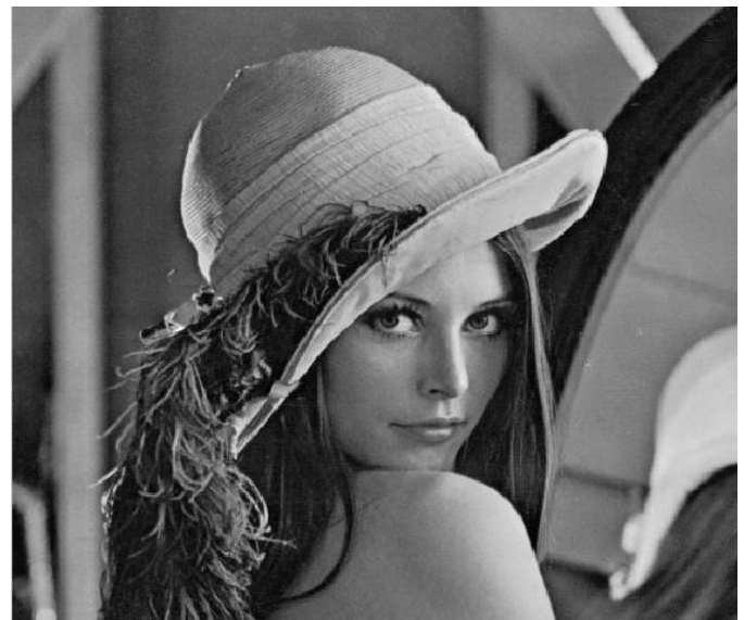
Figure 3.1- Original Lena image

From the table we observed that the proposed system have higher PSNR value in compare with the median filter and that described the higher the PSNR value greater the image quality of compressed or reconstructed of Lena image.