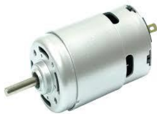
Fig -1: DC MOTOR

A DC motor is any of a class of rotary electrical machines that converts direct current or electrical energy into mechanical energy. The most common types rely on the forces produced by magnetic fields. Two DC motors are used in the making of the prototype. One used to run the cutter and the other to operate the pulley.