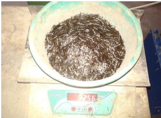
Fig -1: Basalt Fibers

Fibers used for this work are 0.5 %, 1.0% and 1.5% by the weight of cement. Some of the properties of basalt fiber are give in Table 2.