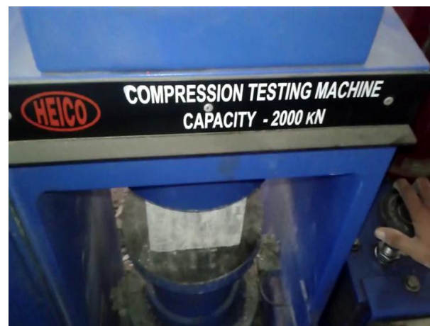
Fig -2: Set up for compression test