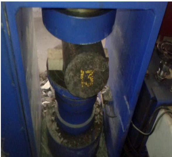
Fig -3: set up for split tensile test.