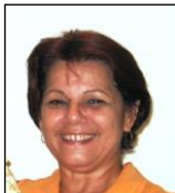
Ph.D Computing, Adviser posgraduate, Habana, Cuba