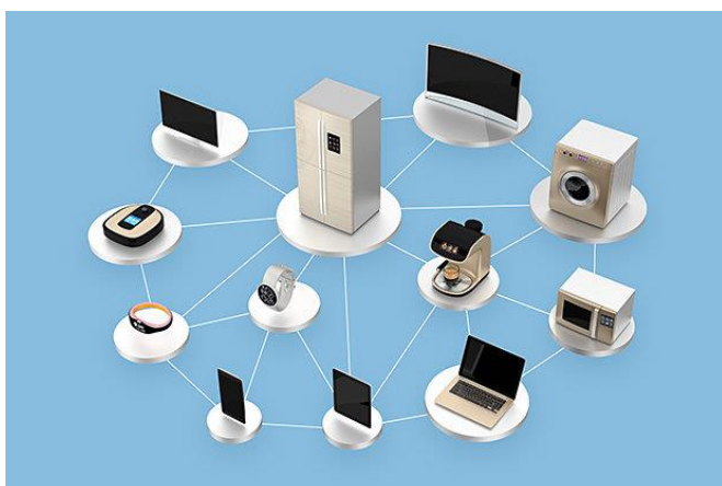
Fig -1: IOT General Structure.

Within 2020 the number of things connected to the internet will be about 50 billion.