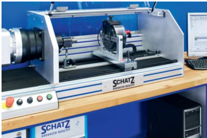
Figure 1: Schatz Torque Tension Testing Machine