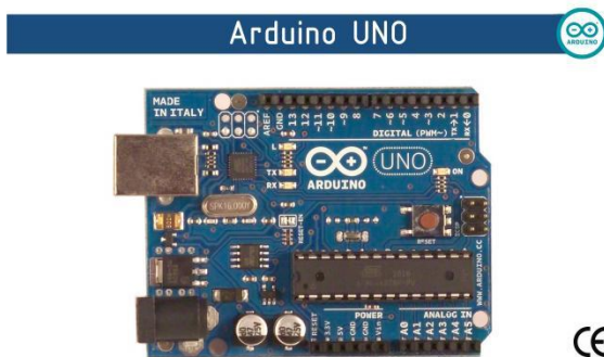
Fig 3.1 Arduino Kit

Arduino is an open source, computer hardware, user community that design and manufactures micro controller kits. Variety of microprocessors and controllers are used to design arduino board.