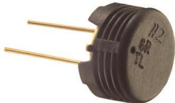
Fig 3.2 : Humidity Sensor

Presence of water in air is called Humidity. Water vapor in the air can affect human comfort and also manufacturing processes in industries. Water vapor in air also influences various physical, chemical, and biological processes.