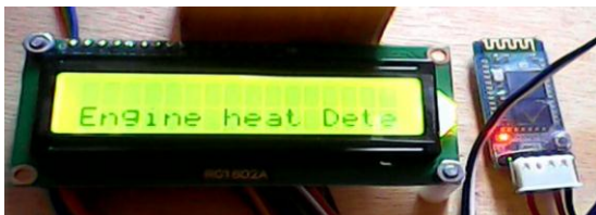
Figure no. 5

When sonar sensor detects distance then distance will displayed on lcd.