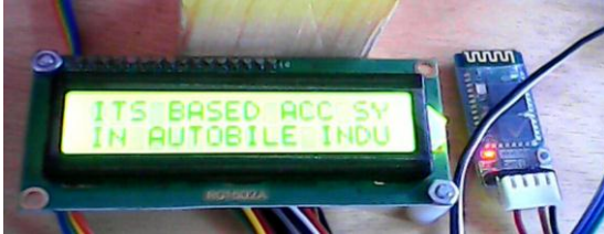
Figure no. 3

When system is initiated the name of project will displayed.