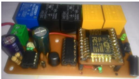
Figure 3.Two wheeler security system device

To start the two-wheeler, we have to open the web-page or the android app. Now, owner has to check the Wi-Fi connection, if it is on than press ON switch on the web page for ignition & than