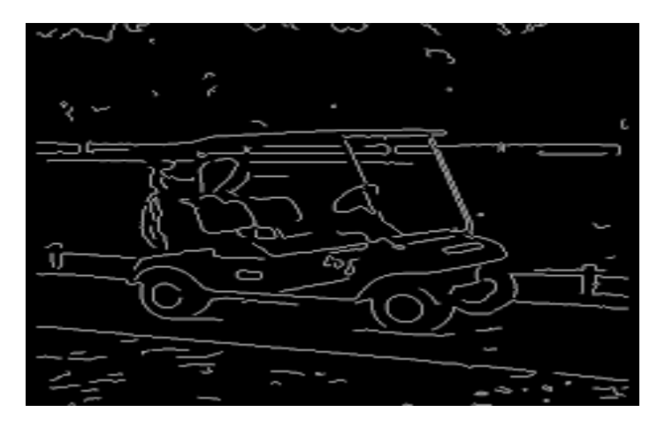
Fig-1: The contour image of a car.

Once we get the actual size of the car, we check for the free slots in the parking lot that would match the estimated car size. If the slots are filled a "slots filled " message is displayed and the next frame of the car that enters the system is taken, and if the slots are not free, the parking lot is checked again untill at least one slot free is available. The fee slot is made available only when a car leaves the system. That free slot is allocated to the car that enters the system. The Entry time of the car is the current system time. Once the vehicle enters the system;