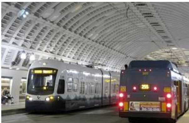
Fig 2.2(b) Tunnel system

So, 25 watt x 4380 hours =1, 09,500 watt-hour.