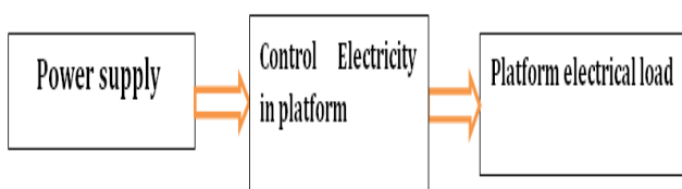
Fig.2.3 (a) Block diagram of platform

For controlling the electricity in platform the LDR is used. When the light level is low the resistance of the LDR is high. This stop the current flow to the base terminal of the transistor. So the LED does not light. However, when the light intensity onto the LDR is high, then the resistance of the LDR is low. So current flows onto the base of first transistor and then second transistor.