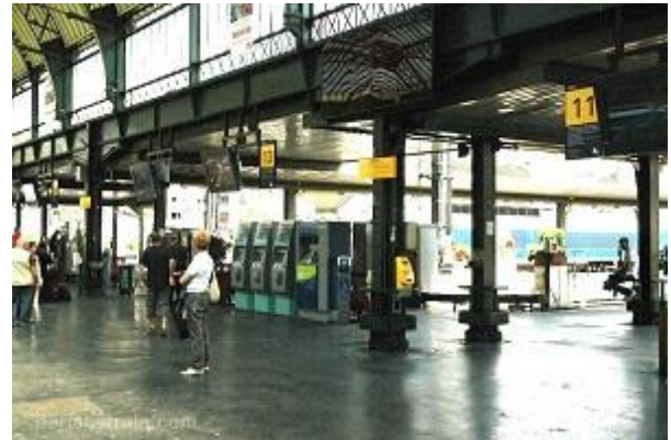
Fig2.3 (b) platform system

1, 09,500 watt saves per year on each lamp.