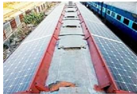
Fig2.1 Solar panel placed on train