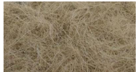
Fig -1 Coir Fibre

Natural fibres like coir fibres can be used as an alternative reinforcement to absorb tension as concrete is weak in tension. The husk consists of coir fibre. It is immersed in water for 6 to 9 months; then the fibre is extracted by beating it manually using a mallet or by mechanical extractor machine.