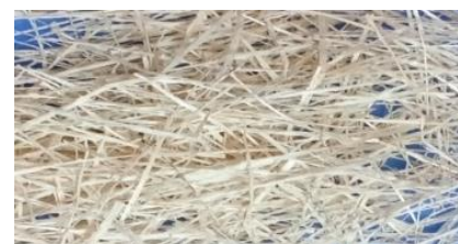
Fig -2 Sugarcane Bagasse fibre

Sugarcane bagasse fibre is natural fibre obtained from sugarcane after extracting the juice. It is an abundant waste fibrous tissue. After extracting juice from the sugarcane, the remaining pulp is known as bagasse. Sugarcane bagasse roughly consists of cellulose, hemicellulose and lignin.