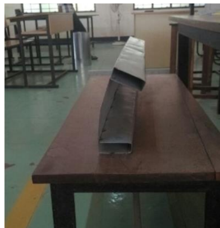
Fig - 6: Web buckling in litesteel beam

In this section, buckling load of litesteel beam and rivet fastened RHFCB is investigated. Litesteel beam failed at 3.4 kN whereas rivet fastened RHFCB failed at 4.8 kN. It can be seen that the litesteel beam failed at considerably lower load than that of rivet fastened RHFCB. Since no welding failure occurred Continuous welding or spot welding do not contribute to the load carrying capacity in LSB. No flange crushing mechanism was observed because the load immediately transferred to the web and thus web buckled at very low load. Flanges in LSBs does not contribute to the load carrying capacity. Hence rotation of flanges were observed .For rivet fastened RHFCB , Flange crushing mechanism was observed because of the stiffness provided by the lips riveted to the web plate. And the additional web element. Hence flanges are strong enough to resist buckling of web.