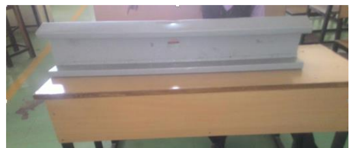
Fig - 9: Flange crushing in rivet fastened RHFCB with one web hole