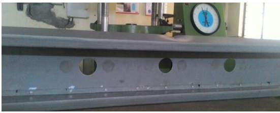
Fig -11: Flange crushing in rivet fastened RHFCB with three web holes