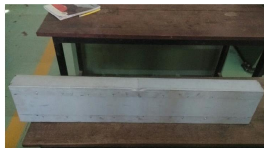
Fig - 7: Flange crushing in rivet fastened RHFCB