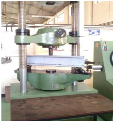
Fig - 1: Experimental setup of litesteel beam