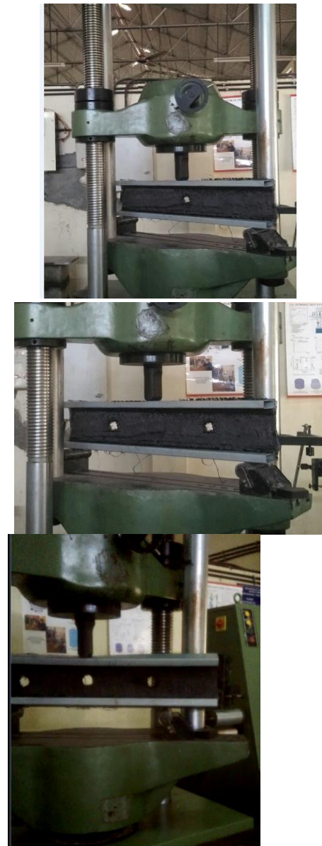
Fig - 6: Experimental setup of Rivet fastened RHFCB with CFRP wrapped along beam length on both faces

CFRP stiffeners are provided because they are light weight and has high tensile modulus which provides elasticity behavior than steel. Hence CFRP stiffeners are adopted.