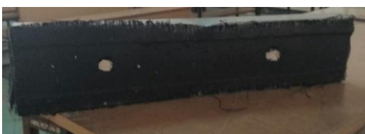
Fig -14: flange crushing in rivet fastened RHFCB with two holes and CFRP No web buckling)