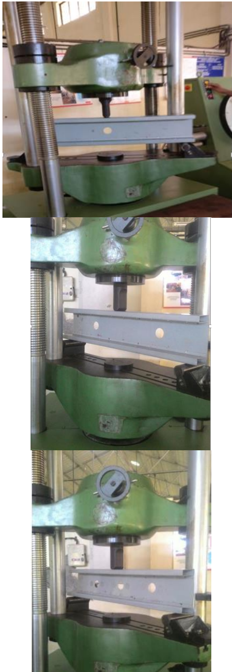
Fig - 5: Experimental setup of Rivet fastened RHFCB with one web hole, two web holes and three web holes

In this part specimen with web holes were investigated. Web holes of 50mm diameter is created at L/2, L/4 and L/8 of the specimen. Effect of number of web holes on rivet fastened RHFCB are studied.