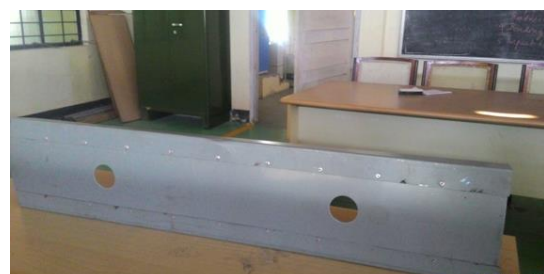
Fig - 10: Web buckling in rivet fastened RHFCB with two holes