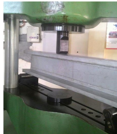
Fig - 3: Experimental setup of Rivet fastened RHFCB