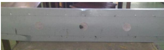
Fig -12: Web buckling in rivet fastened RHFCB with three holes