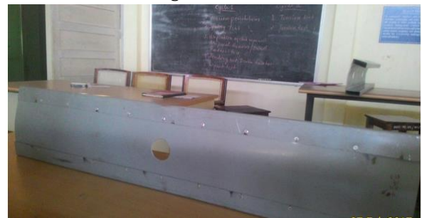
Fig - 8: web buckling in rivet fastened RHFCB

The results shows that by increasing the number of holes, the buckling load of the rivet fastened RHFCB decreases continuously. It is evident that an increase in the number of holes when the diameter of web hole causes a considerable reduction in the buckling load of rivet fastened RHFCBs