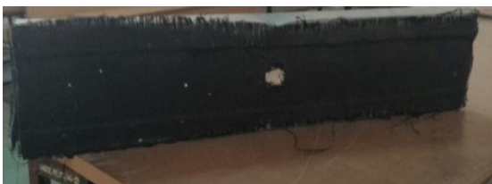
Fig -13: Flange crushing in rivet fastened RHFCB with one hole and CFRP (No web buckling)

It is evident that while providing CFRP plate stiffener the web buckling didn't occur and the specimen failed at much higher load than that of without CFRP. Thus the buckling load got increased. The results obtained in this study is compared with the results of specimen without stiffener.