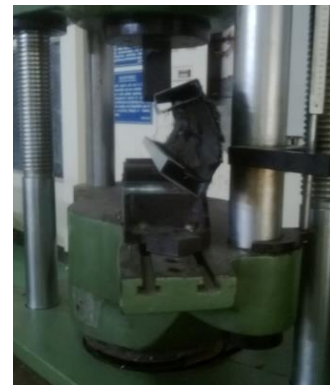
Fig -15: Web buckling in rivet fastened RHFCB with three holes and CFRP