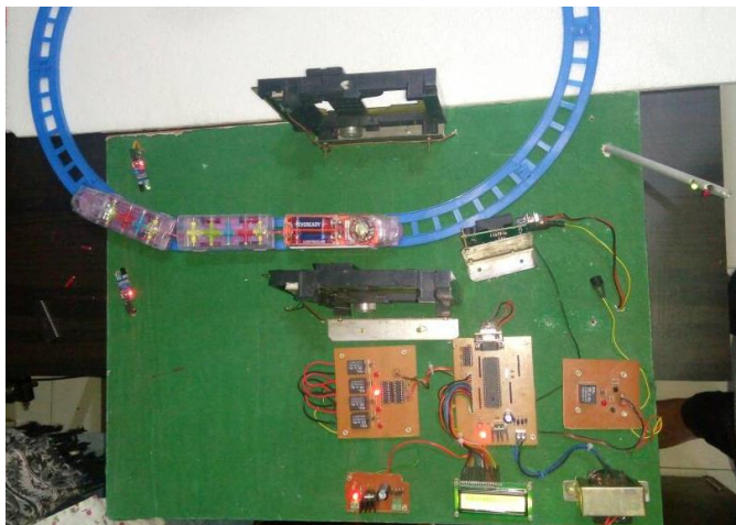
Fig-3: Proposed model of system